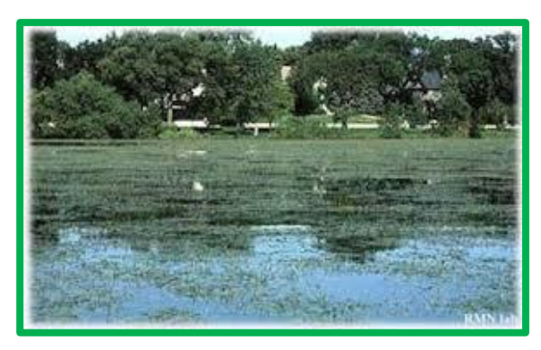
Rooted submerged weeds, such as Milfoil, Elodea, Hydrilla

HENNING MARINE, Division of DREDGE BOAT, LLC 6449 S. Tex Point, Homosassa, FL. 34448 USA. Tel: 519-400-5951