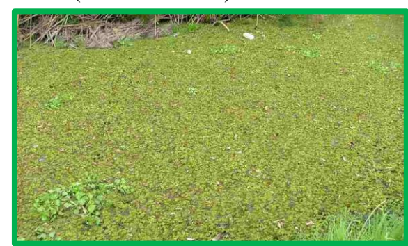
Dense floating weeds, such as Water Hyacinth, Salvinia, Duckweeds